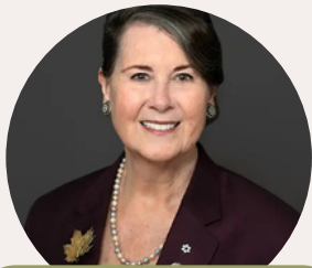
Hon. Marilou McPhedran, Senator