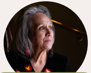
Hon. Mary Jane McCallum, Senator