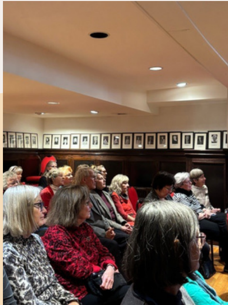
UWC Engage Holiday Lunch with Westgate Mennonite Collegiate Choir. You may view the video here .