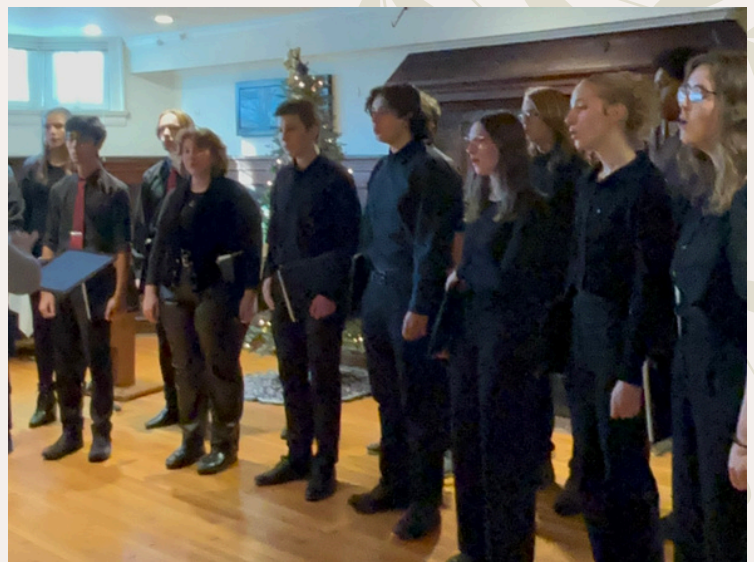
Westgate Mennonite Collegiate Choir